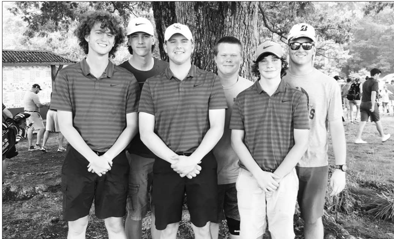
The Towns County boys golf team at Double Oaks Golf Course in Commerce. Photo/submitted

brutal early season knee dislocation to return to the team for Area and State, shooting in the 80's in both tournaments, while still wearing a brace on the injured knee.